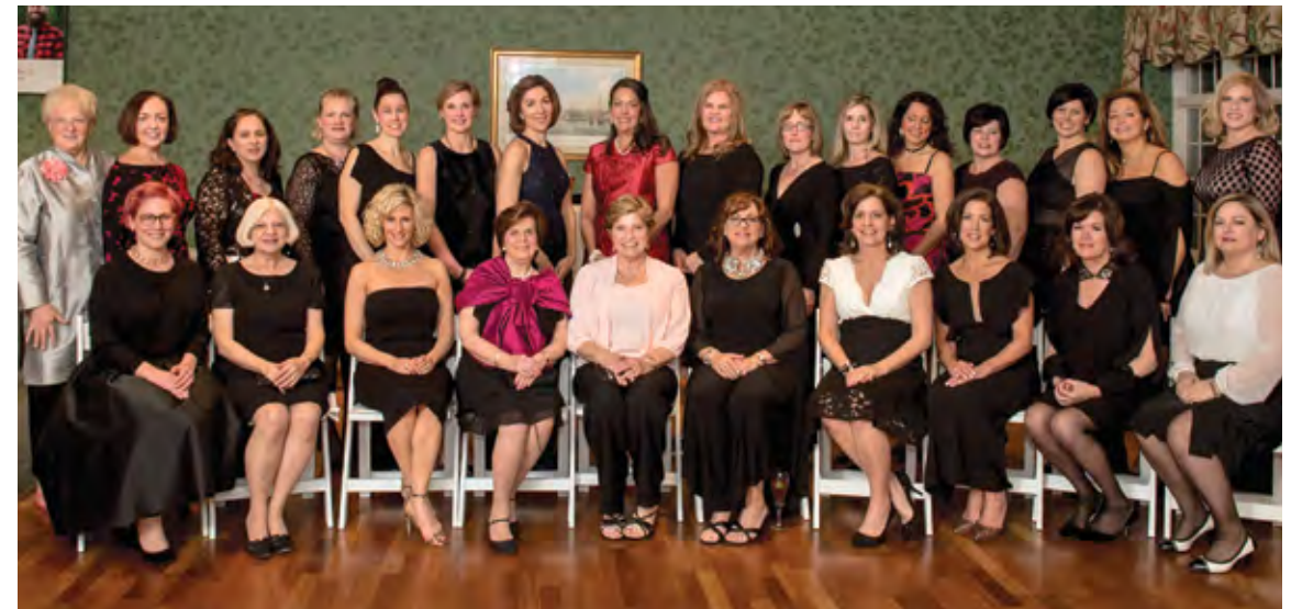
Our incredibly dedicated and talented event-planning committee gathers before the festivities begin.