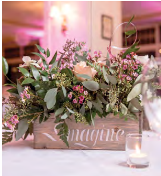
One of the many touches of this year's theme: Imagine.