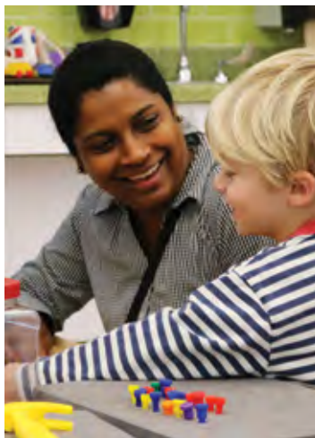
PEACE Place before- and after-school care

Our donors and private funders should know that it's their additional support that allows our work to expand beyond the basics and dig deep to serve. Without those additional funds, we simply couldn't work as broadly.