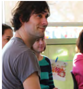
Parent Leadership Training Institute