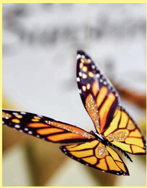
One of more than 150 butterflies suspended from the ceiling