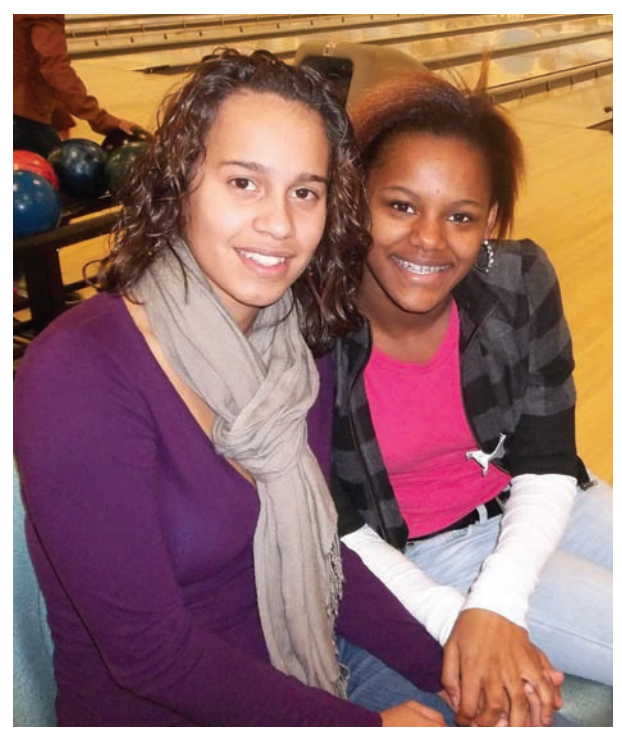
Two CBLS participants enjoy socializing at a bowling outing.

The emphasis on both self-reliance and community resources encourages the participants to begin assuming responsibility for managing their own lives and helps reduce the isolation they may feel. Group discussions provide the opportunity to discuss their expectations and fears about going out on their own. Peer support helps relieve anxiety as the young people prepare for independence.