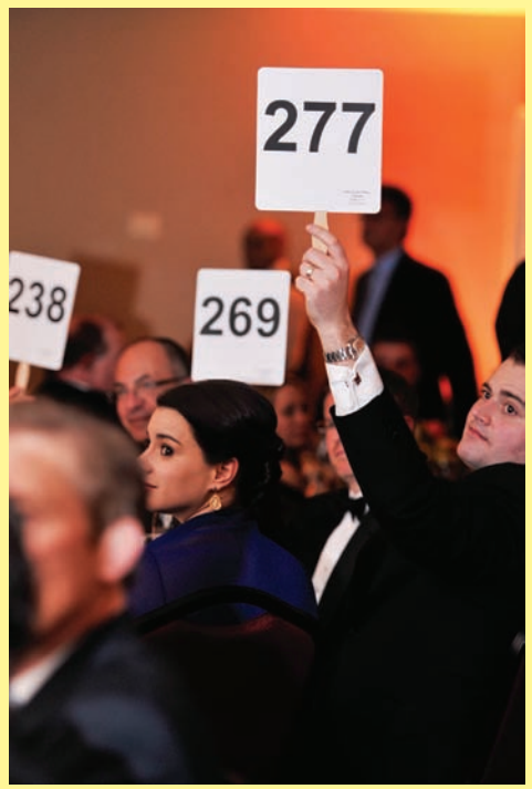
The bidding gets lively in the Changing Lives Challenge. Guests were given the opportunity to raise their paddles to support Bridge programs for children and families in amounts ranging from $5,000 to $100.