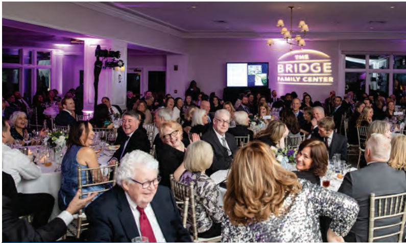
Guests enjoy dinner at the Hartford Golf Club