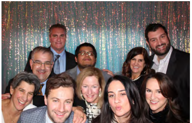
Guests of Sapphire Sponsor Double AA Veterinary sharing a laugh in the photo booth