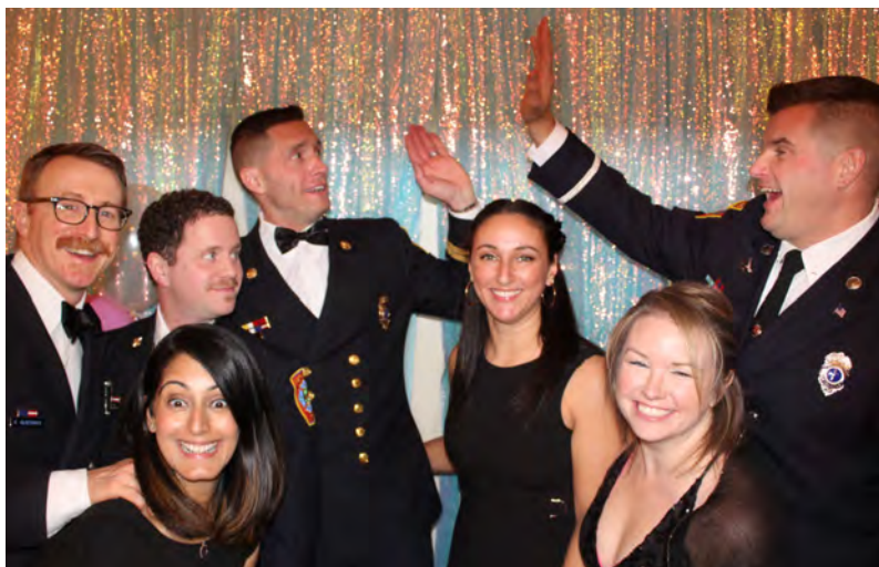
Bottom Right: Members of the West Hartford Fire Department and their guests