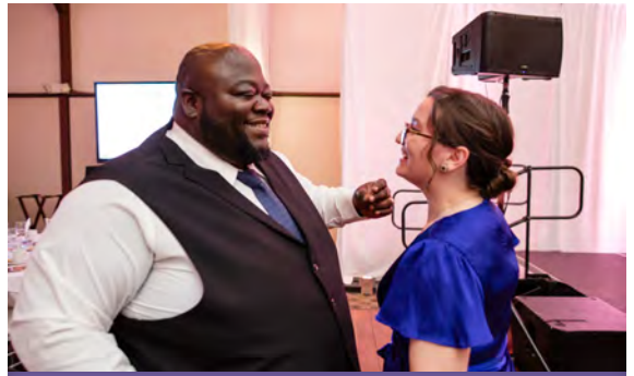
Guests cap off the evening with dancing