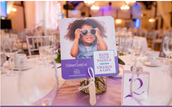
Thanks to generous donors, our Changing Lives Challenge raised $58,600 for our children and families!